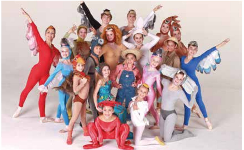
A grant to the Cuyahoga Valley Youth Ballet will help children from low-income families attend live dance performances at the Akron Civic Theatre.