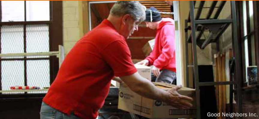
Good Neighbors Inc.

*Legacy Funds, or funds that were designed by their founders to grow in perpetuity.