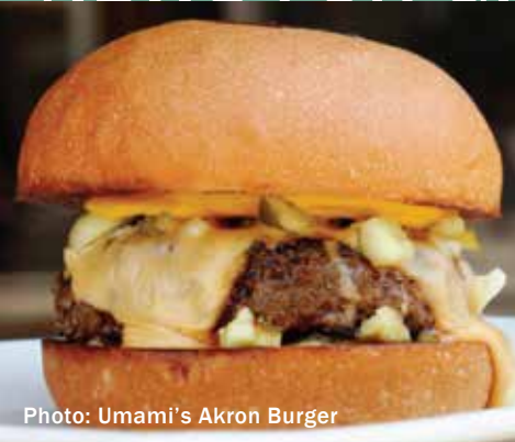
Photo: Umami's Akron Burger