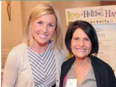
Center: Akron Community Foundation staff meets with a delegation of Serbian leaders.