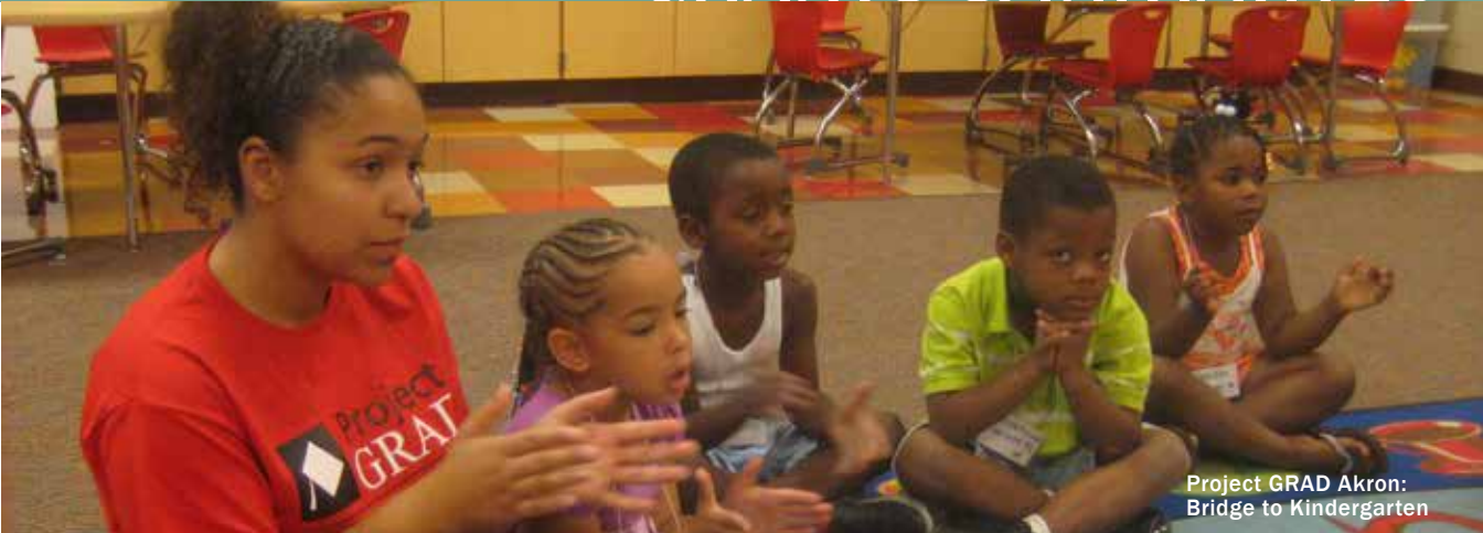
Project GRAD Akron: Bridge to Kindergarten