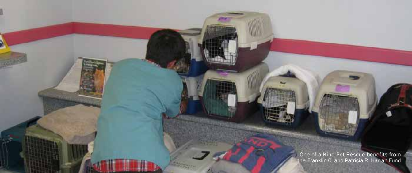
One of a Kind Pet Rescue benefits from the Franklin C. and Patricia R. Harrah Fund