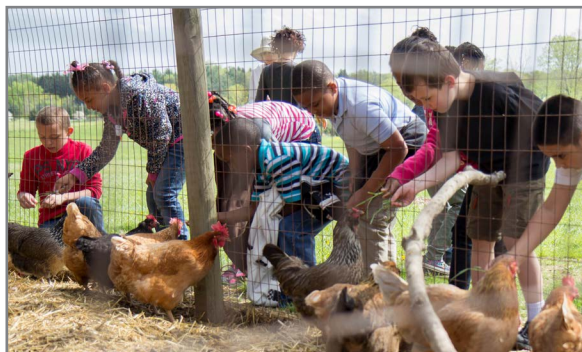
A grant to Crown Point Ecology Center offers area children hands-on experience on a 115-acre farm and nature preserve.

For a complete list of grants awarded this year, visit www.akroncf.org/millenniumgrants .