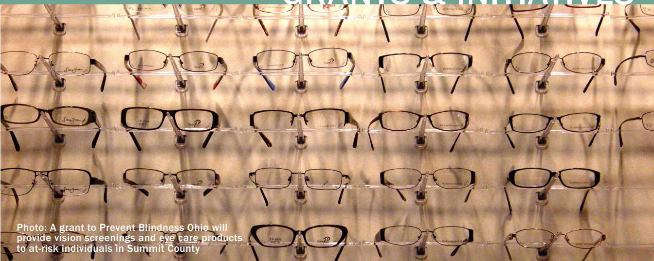
Photo: A grant to Prevent Blindness Ohio will provide vision screenings and eye care products to at-risk individuals in Summit County