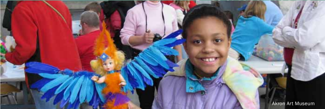
Akron Art Museum