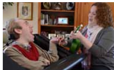
View the Expressive Therapy Center video created by ADMC: www.akronist.com/ACH .

Traffic to Akronist.com , the center's online news outlet, has steadily increased thanks to high-quality articles, like a recent profile of Akron Children's Hospital's Emily Cooper Welty Expressive Therapy Center. This, along with community-focused and citizen journalist-driven public service messages, as well as other stories about local nonprofit organizations and schools, resonate in the Akron community and beyond.