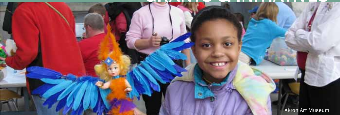
Akron Art Museum