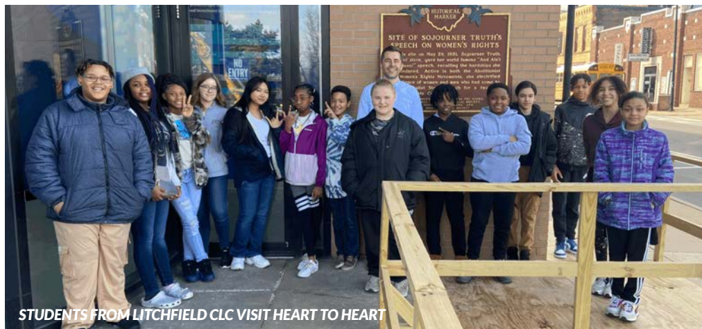
STUDENTS FROM LITCHFIELD CLC VISIT HEART TO HEART

Presenting energy awards to our girls at the end of each lesson is a way to celebrate girls empowering girls! Today we celebrate the Medina County Women's Endowment Fund of Akron Community Foundation for their continued support of our program participants!