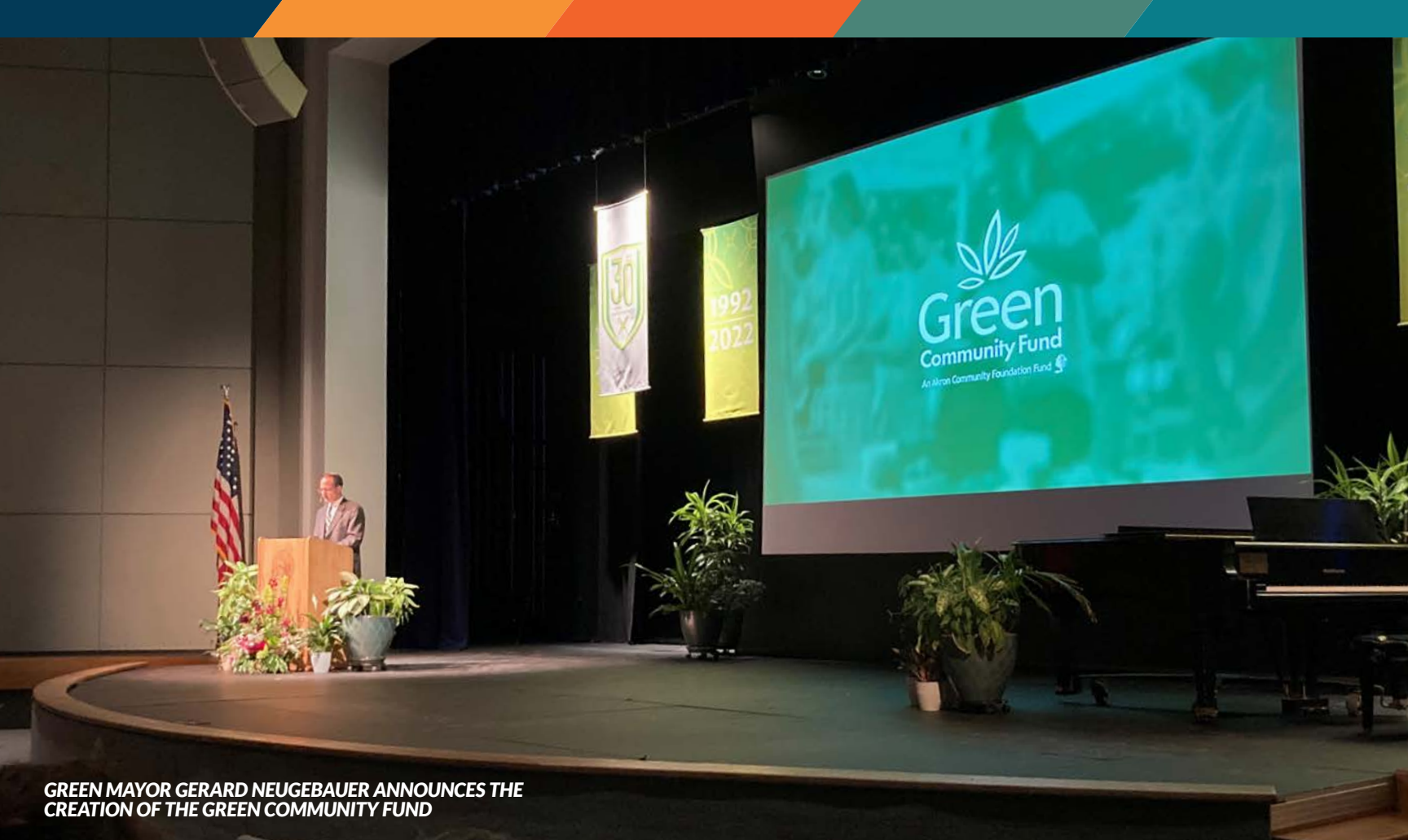
GREEN MAYOR GERARD NEUGEBAUER ANNOUNCES THE CREATION OF THE GREEN COMMUNITY FUND

Created in 1999 as a partnership between the Akron Beacon Journal and Akron Community Foundation, the Millennium Fund for Children has since grown to $1.2 million and awarded nearly $950,000 in grants to grassroots children's programs. Applications for the fund's next round of grants are due Sept. 1. Apply online starting Aug. 1 at akroncf.org/applyMillennium .