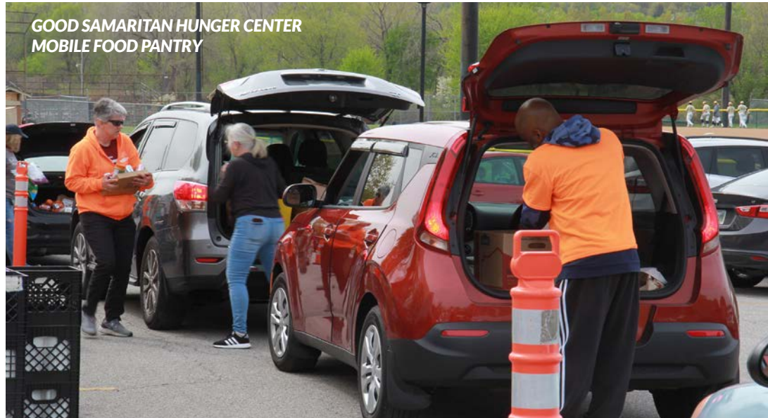
GOOD SAMARITAN HUNGER CENTER MOBILE FOOD PANTRY