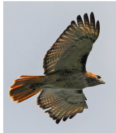
RED TAILED HAWK