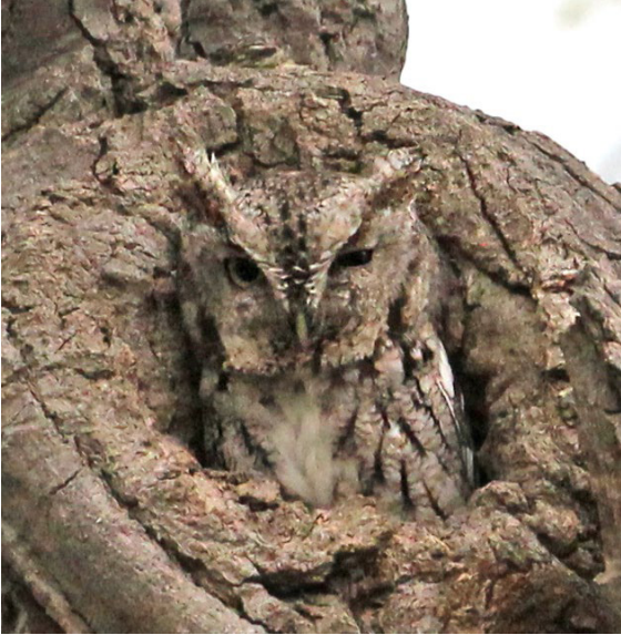
EASTERN SCREECH OWL