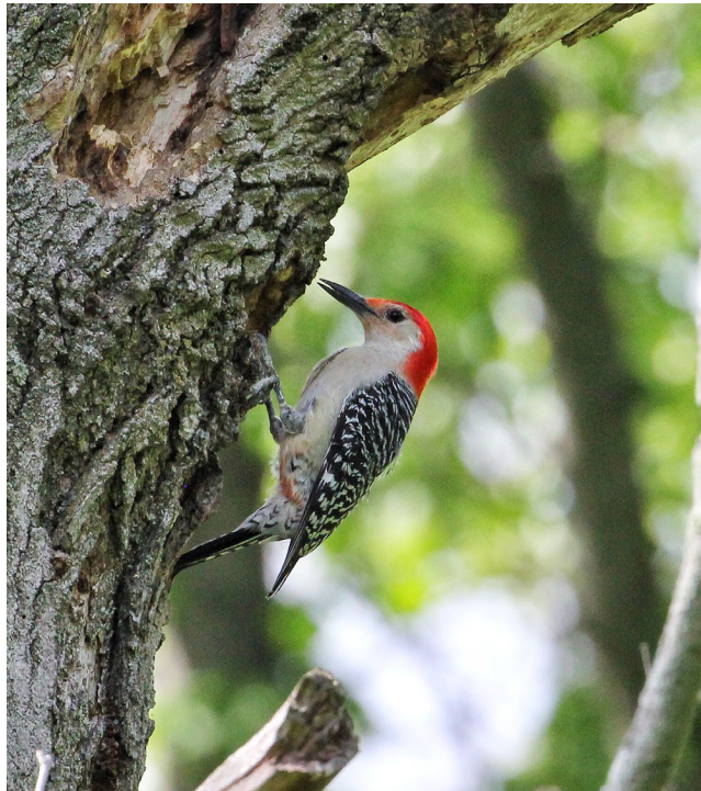
RED BELLIED WOODPECKER