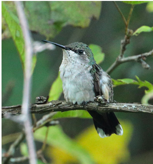
RUBY THROATED HUMMINGBIRD