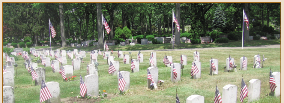
A new agency endowment fund will help maintain the grounds of Oakwood Cemetery.