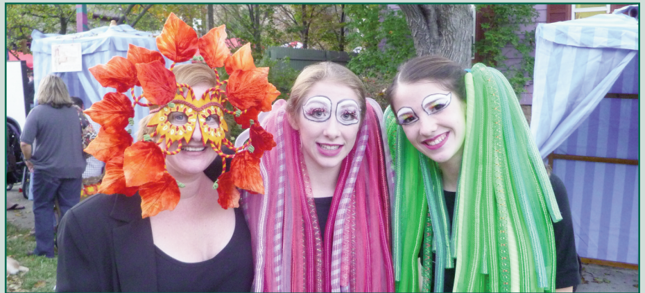
A Neighborhood Partnership Program grant to the University Park Business Association will support the Light-UP Lantern Festival, a family-friendly showcase of local artists and performers.

"This project will benefit the neighborhood by breathing new life into an oft-