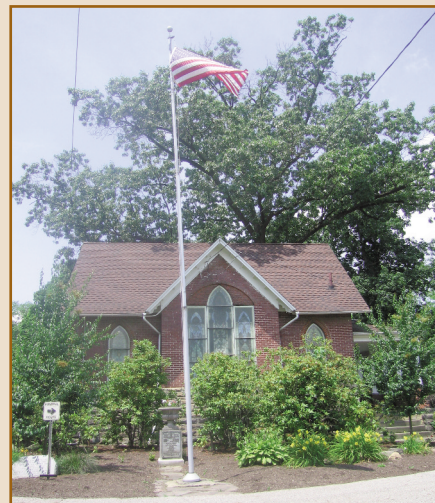
A new endowment fund will help preserve the beauty of the chapel at Oakwood Cemetery.

This fund will support the beautification and upkeep of the Oakwood Cemetery Chapel.