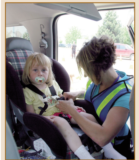
A grant to the Medina County Health Dept. will give car seats to local families in need.

Oaks Family Care Center Inc. , to purchase gas cards for women in the mental health peer-to-peer therapy program, $400