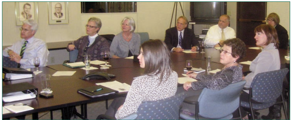
ACF board members and arts supporters participate in a discussion about the arts in Summit County.

The county's general fund has decreased due to the economy, Pry said, forcing the local government to focus on necessities. This presents a serious funding challenge for arts organizations, many of which are turning to foundations for increased sup-